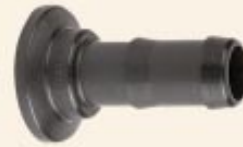
Flange x hose barb