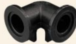
90° Flange x 90° flange