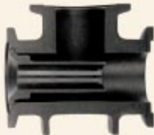
Flanged tee with 1" inductor