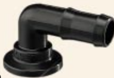
Flange x 90° barb